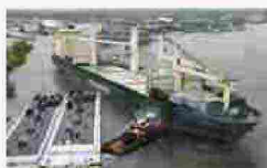
Mann (ABS): we are confronting the three major challenges of the shipping business