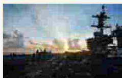
Satellite images reveal show of force by Chinese navy in South China Sea