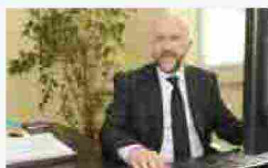
Containers: "One" wants to grow in Italy