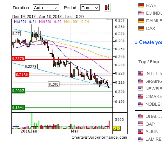
Chart D'AMICO INTERNATIONAL SHIP