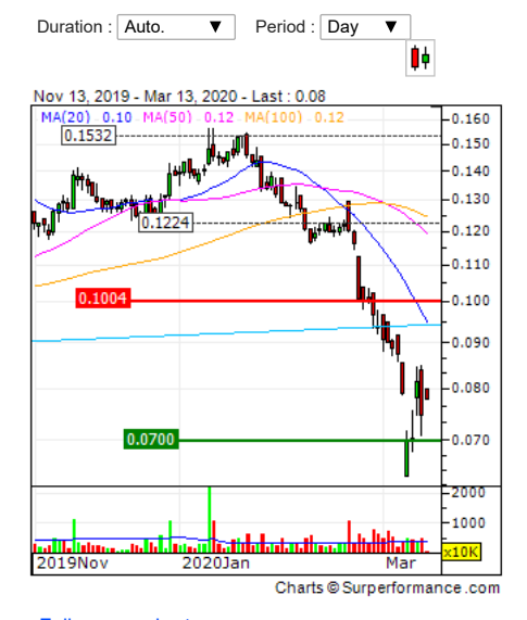
Chart D'AMICO INTERNATIONAL SHIPPING S.A.